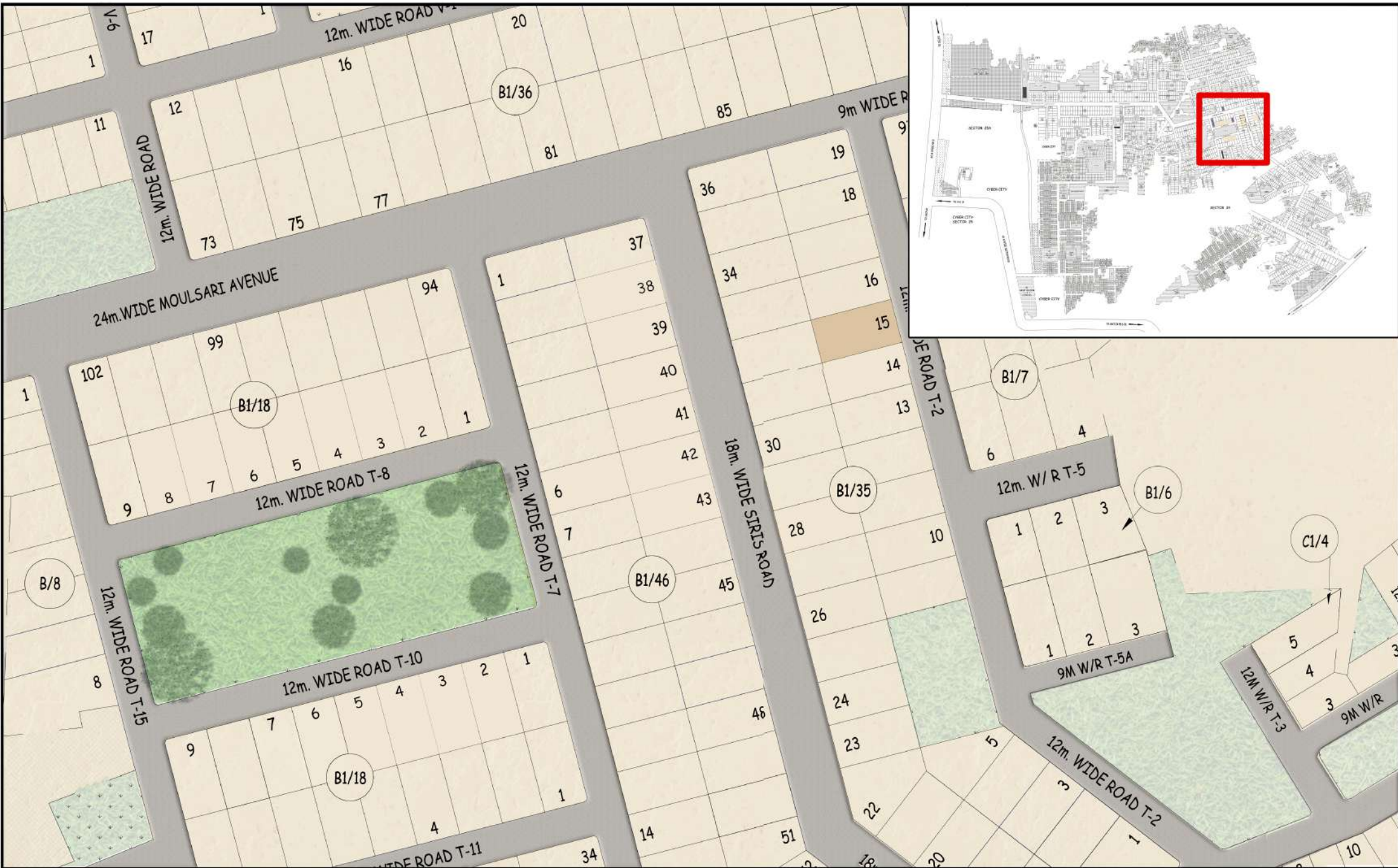
LOCATION PLAN FOR T-2/15